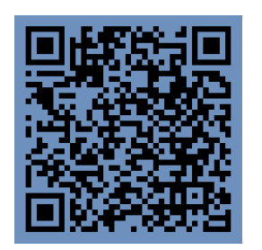
Help Us Build Bridges with a gift today