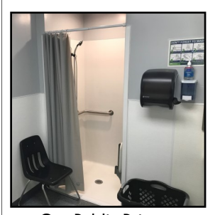
Our Public Private Shower is in use!