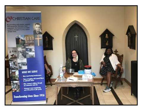
At our Pancake Breakfast