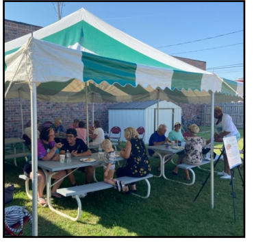
At Christian Care's Donor Appreciation Picnic