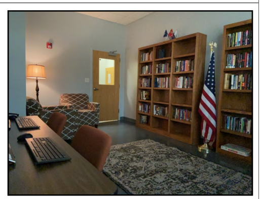
Our Resource Room is being used for education & to find jobs!