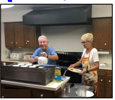
Awesome Volunteers serving up pancakes!