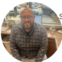
Zavery Client Advocate